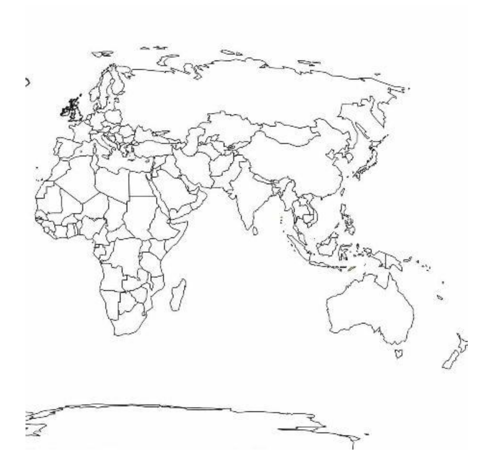
Geography: Label the following countries: China, India, South Africa, Germany, Great Britain, Vietnam, Japan